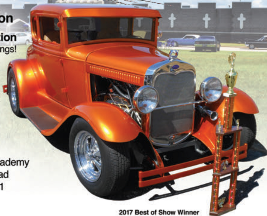
2017 Best of Show Winner